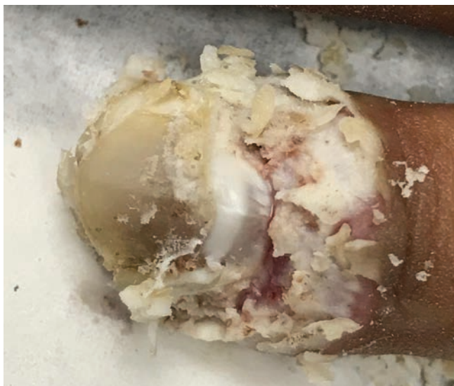
Figure 3. Left fifth finger following curettage due to thick maceration of the skin.