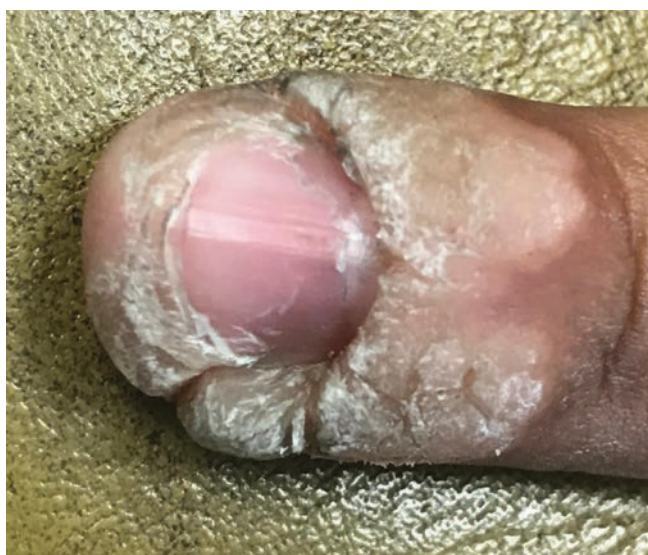
Figure 1. The patient presented with an extensive periungual wart on the left fifth finger.

Attempts have been made to improve the effectiveness of topical treatment. Compounding pharmacies routinely make SA plasters, and some clinicians advise SA along with imiquimod or 5-fluorouracil (5-FU) under tape occlusion. Verrumal, a combination of 0.5% 5-FU and 10% SA, has been available for the last 30 years in Europe. This combination of 5-FU and SA has been found