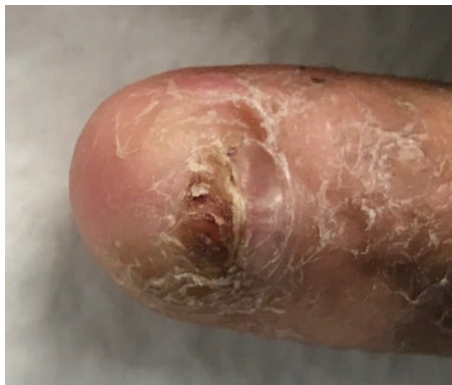
Figure 4. Left fifth finger 1 week after curettage and discontinuation of WP treatment.

to be superior to 5-FU alone for the treatment of common and plantar warts. 4 Across all studies, complete healing was achieved in 63.4% of common warts treated with 5-FU/SA compared with only 23.1% treated with 5-FU alone. Similar disparity in complete healing was seen in plantar warts (63% vs 11%, respectively). However, these cure rates 4 were achieved over a 1 to 3 months and not a few weeks as patients desire.