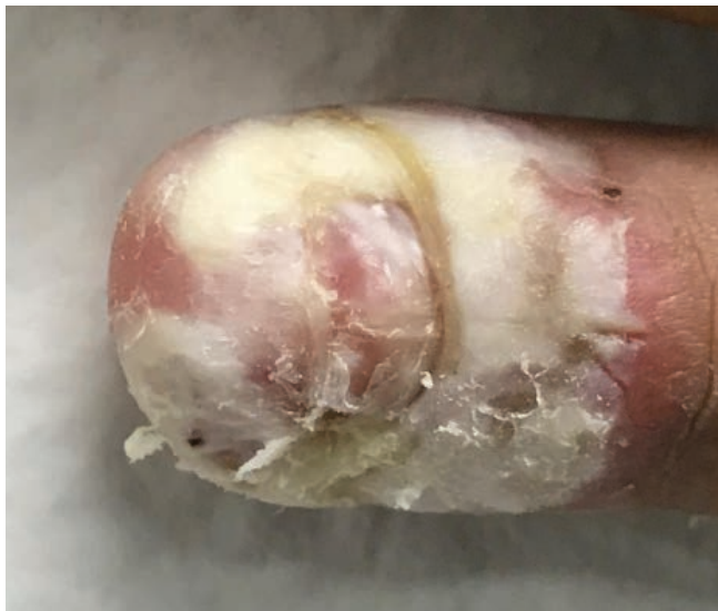
Figure 5. Left fifth finger after 5 days of additional treatment with WP to treat residual wart.