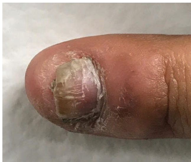
Figure 6. Left fifth finger 4 weeks post treatment. The patient's warts completely resolved.

It is important to understand that the WP vehicle (Remedium delivery system) is just as crucial to the effectiveness of the treatment as the active ingredients. A waterproof tape also comes with the treatment to improve maceration and penetration in hyperkeratotic warts. How WP works is best understood by examining its unique properties.